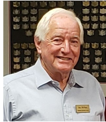
Mayor Steve Pellegrini Township of King